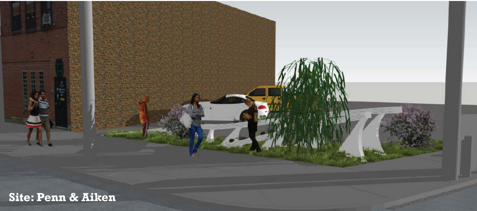
Site: Penn & Aiken